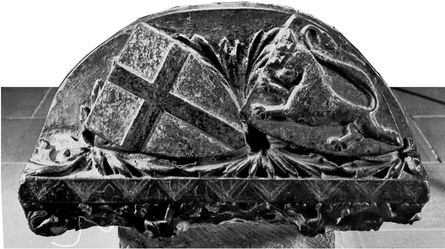
Figure 3: The foot end of the monument of Konrad von Thüringen at Marburg.

as those of his office painted in the small corridor of his rooms in the headquarters of the Order, Marienburg Castle, now Malbork in Poland ( Figure 4 ). 8