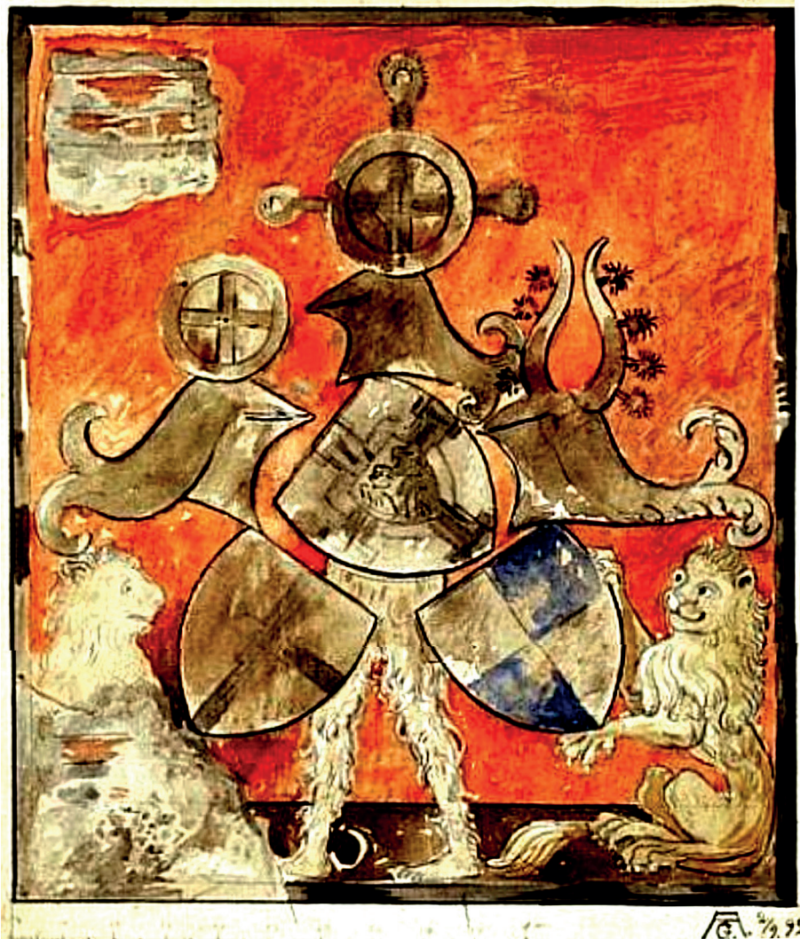
Figure 4: Konrad von Jungingen's arms and crest, Marienburg Castle.

might be selected to be Hochmeister, but the college usually elected a senior officer with a long impeccable service, who had served at least once in the inner council of the Order, and held one of the five grand offices. These were the offices of grand commander (Grosskomtur, deputy to the HM), chief marshal (Oberster Marschall), chief master of the Robes (Oberster Trappier), chief hospitaller (Oberster Spittler) and treasurer (Tressler). The office of chief marshal was appurtenant to the commandery of Königsberg, that of chief master of the Robes to the commandery of Christburg, while the chief hospitaller held the commandery of Elbing. The Hochmeister was a sovereign prince in Prussia, responsible to the Pope, and like other German princes,