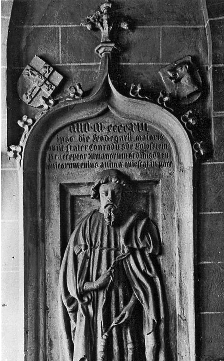
Figure 6: Memorial to Jakob Egloffstein (d.1416), Nuremberg.