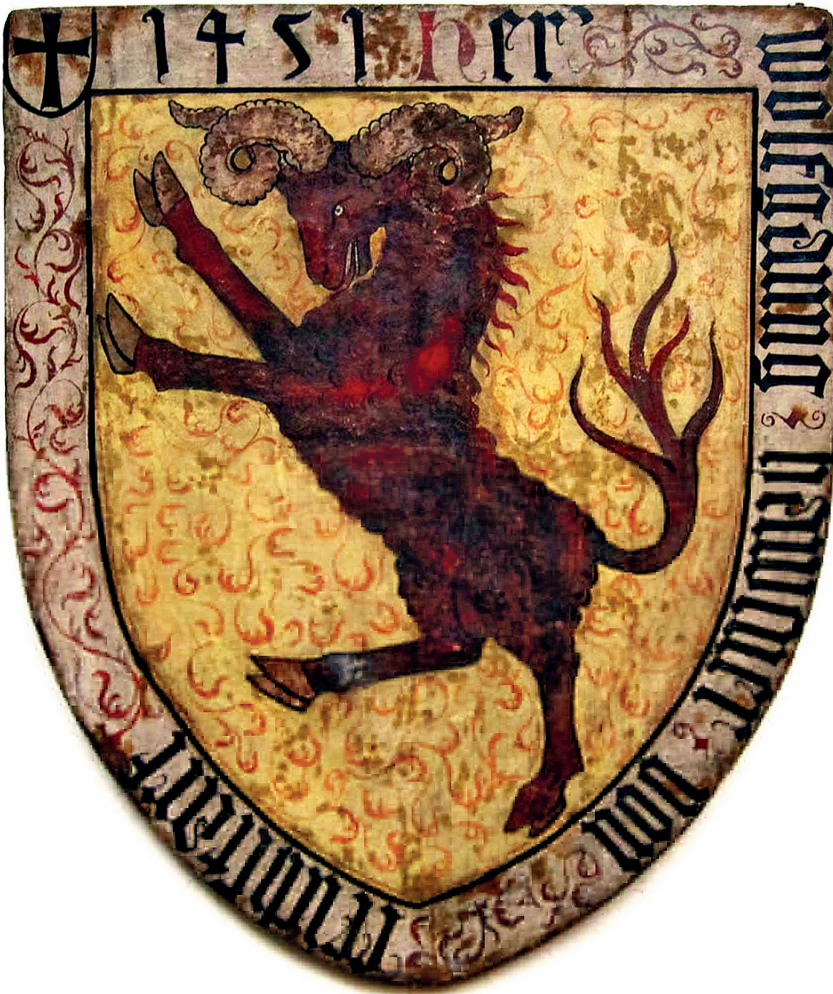
Figure 10: Aufswörschild (inswearing shield) for Wolfgang Haussner, 1451, in St.Jakobskirche, Nuremberg.. (wikipedia)