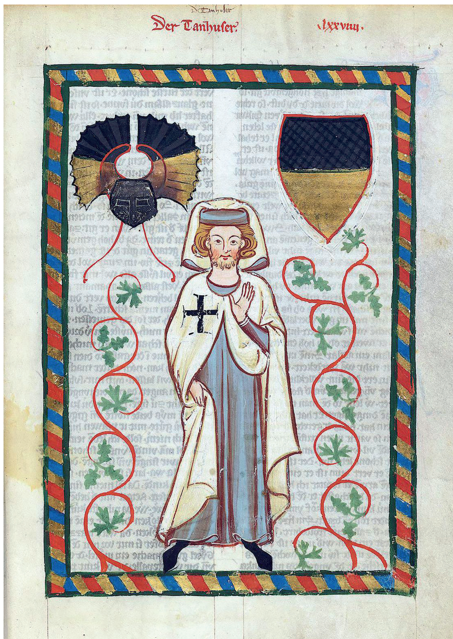
Figure 1: Tannhäuser in the Codex Manesse of c.1300.