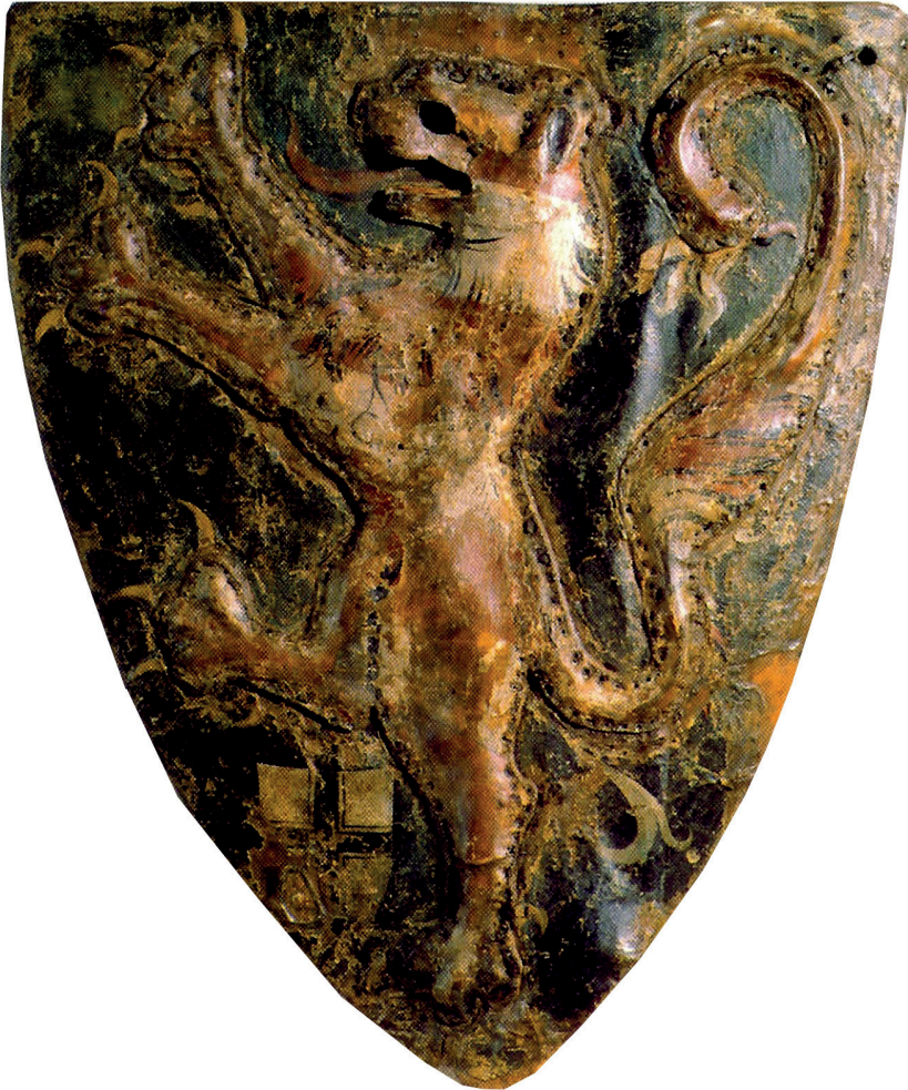
Figure 2: The funeral shield of Konrad von Thüringen c 1241.

family's sepulchral church in Marburg with both his family arms and the arms of the Order on the footstool of his monument ( Figure 3 ). 7 Another Hochmeister, Konrad von Jungingen (HM 1393–1407) had a display of his personal arms and crest as well