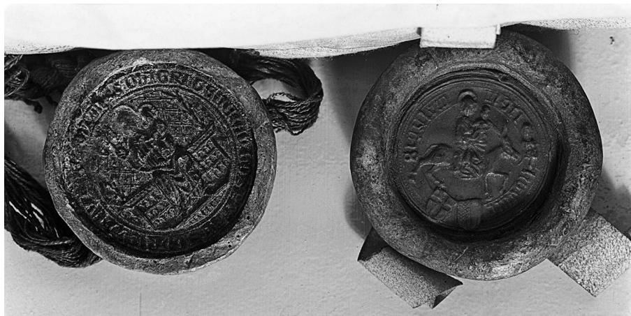
Figure 11: Seals of Heinrich Dusmer, 1347 with emblem of office (Mary & Child); and of Goswin von Hercke, LM Livonia 1345–60, with emblem of office (flight to Egypt) and shields with arms of the Order and his personal arms ( per pale ). Document from Reval, Rathaus (1940), now on www.bildindex.de , image fm151482 (Fotoarchiv Marburg).