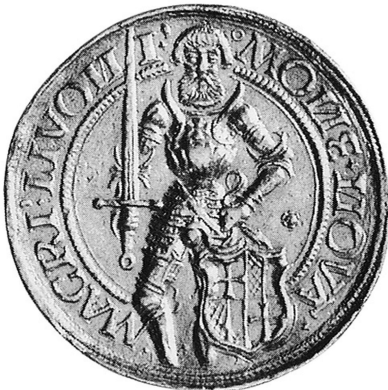
Figure 12: Livonian coin minted by Walter von Plettenberg.