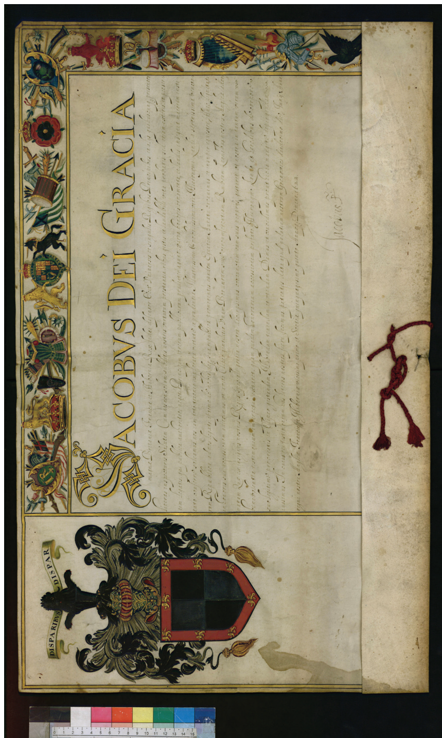
Sezione di fotoreproduzione, Archivio di Stato in Venezia. Reproduced by permission (atto di concessione n. 54/2016).

Letters patent of James I of England granting an augmentation to the arms of Girolamo Lando, Venetian Ambassador to London, dated at Greenwich 12 June 1622. See page 21.