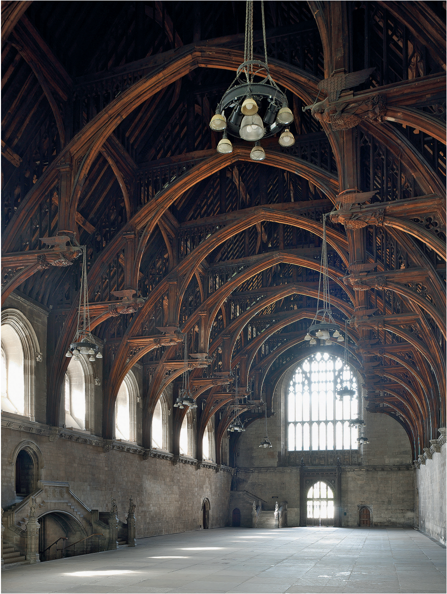
Figure 1: Westminster Hall looking north (UK Parliament).