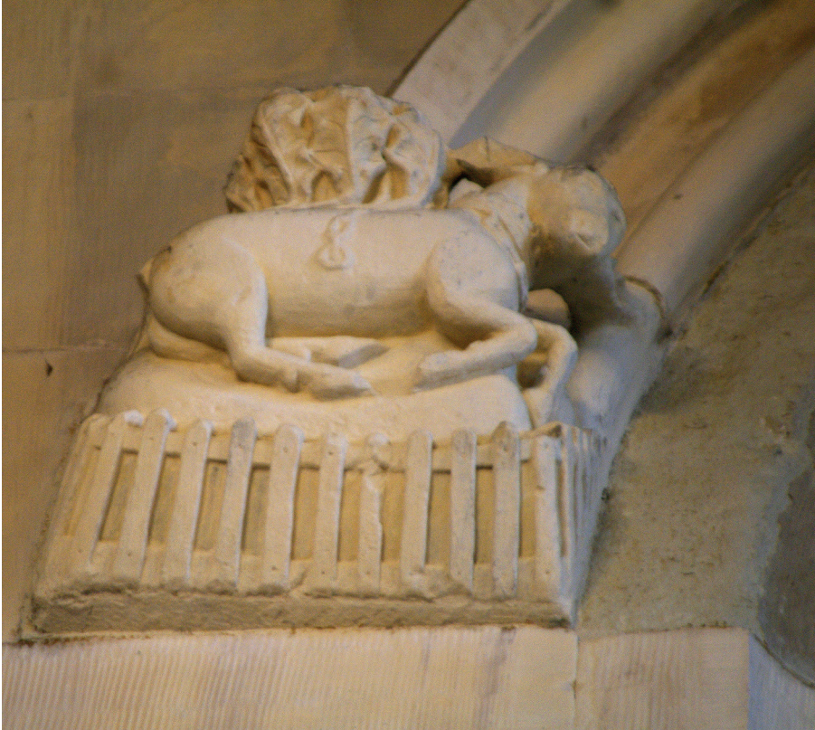
Figure 8: Label stop of a hart within an enclosure.

a palisade, and a shield bearing the arms of the Confessor. The west label stop shows the white hart supporting a shield with the royal arms dexter, with the sinister plain and un-carved, which must have been intended for the queen. 22