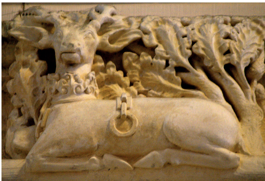
Figure 3: Collared harts from the string course.