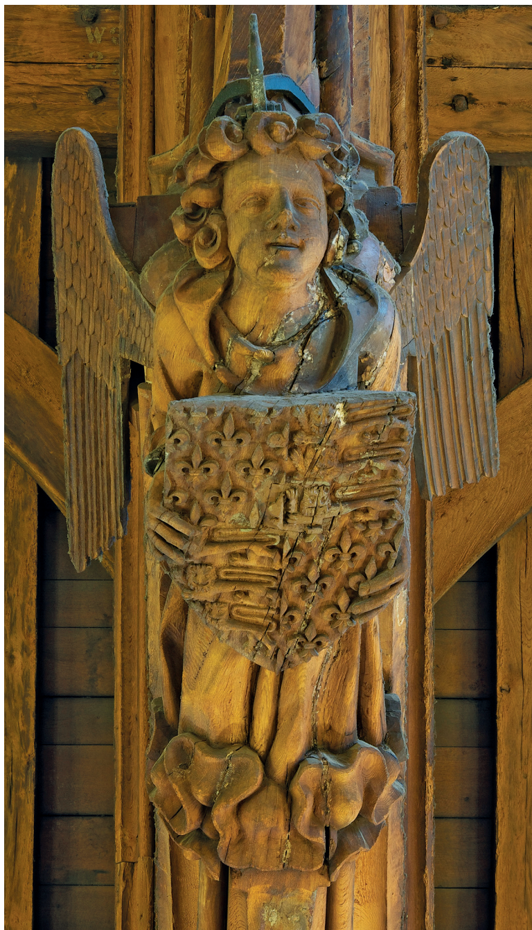
Figure 9: Hammerbeam end roof angel (UK Parliament).