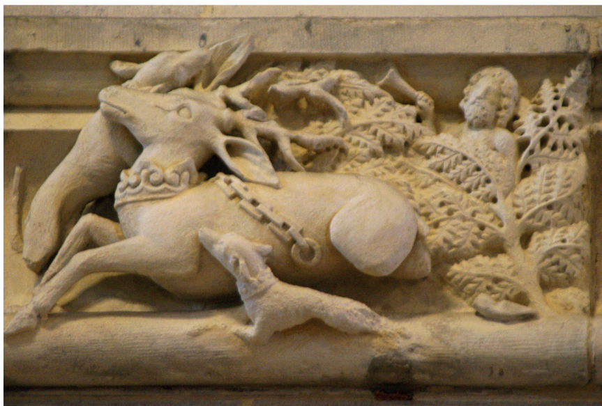
Figure 4: TOP: hart on cart, badly eroded, BOTTOM: hart being hounded