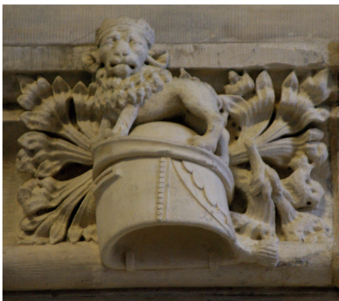
Figure 2: Royal helm and crest on the string course, with and without feathers. TOP: UK Parliament; BOTTOM: Editor.