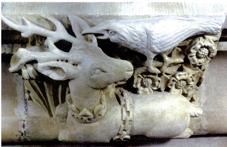
Figure 5: TOP: hart hunted (Editor). BOTTOM: hart pecked by a crow (UK Parliament).