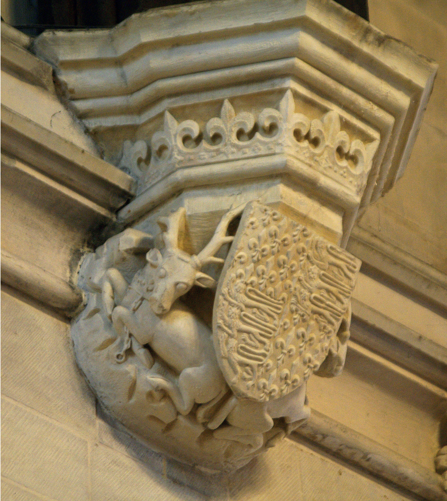
Figure 7: Corbel with royal arms of England supported by harts (photo by Editor).

human heads, and there is a single owl, perhaps to imply the wisdom of the lawyers at the courts of law. The two larger label stops of the south window were lost when the window was set back. 21 The east label stop shows a white hart gorged and couchant in