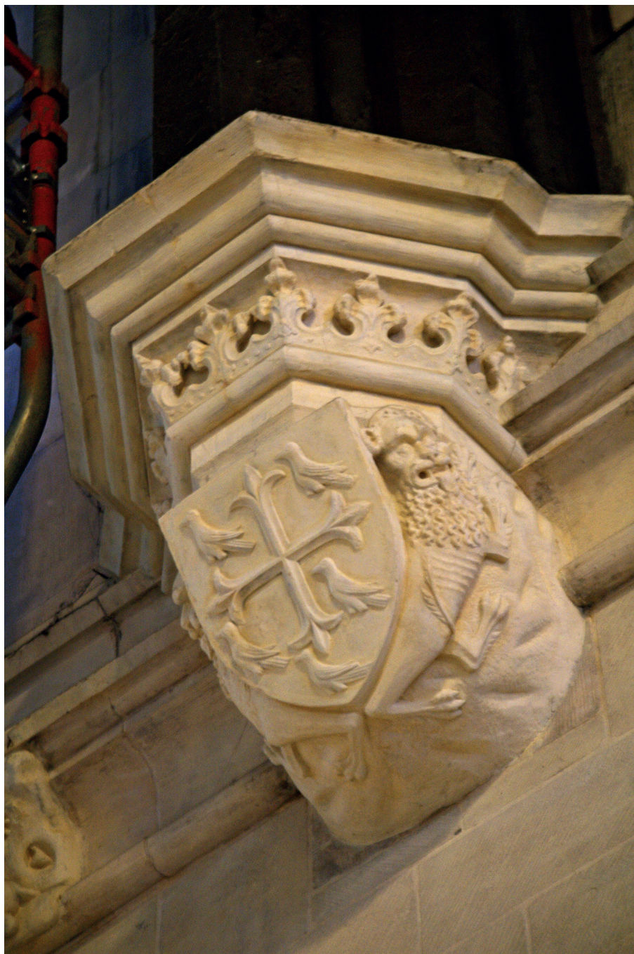
Figure 6: Corbel with shield of St Edward the Confessor supported by lions