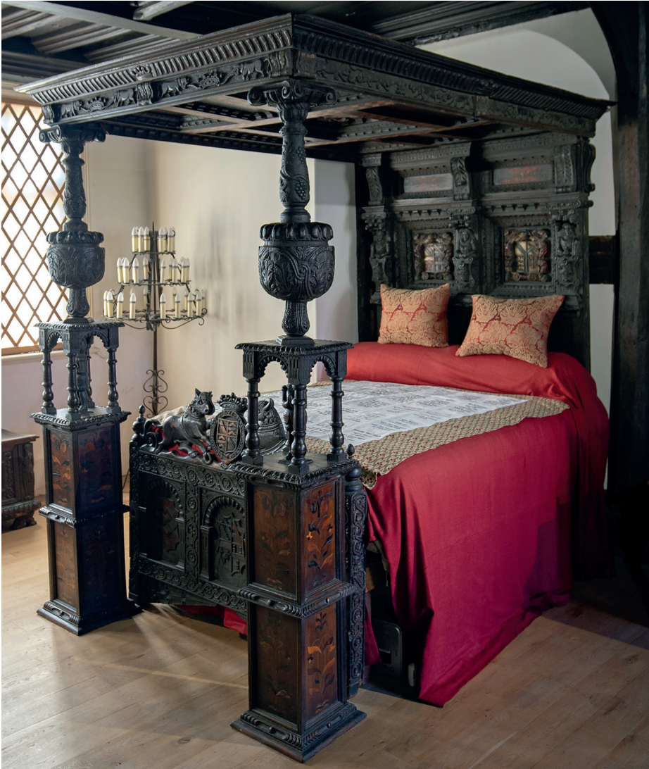
Figure 1: The ‘Radcliffe Bed’, c.1572, c.1843–48. Private Collection on Loan to Ordsall Hall, Salford.

house in Uppermill surrounded by other pieces of furniture that he had made when the contents of St Chad’s, his home in Uppermill on the border of Greater Manchester and Yorkshire, was put up for auction in 1920. Seen in ‘bedroom over dining room’ ( Figure 3 ), 4 the bed was catalogued as ‘an exceptionally fine OLD OAK “ELIZABETHAN” BEDSTEAD, richly carved and inlaid, with canopy supported on massive columns