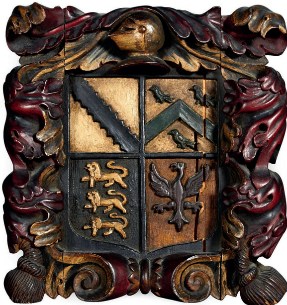
Top, Figure 6 : Detail of the Sir John Radcliffe arms on the headboard of the 'Radcliffe bed', c.1572. Bottom, Figure 7 : Detail of the Anne Asshawe arms from the same location.