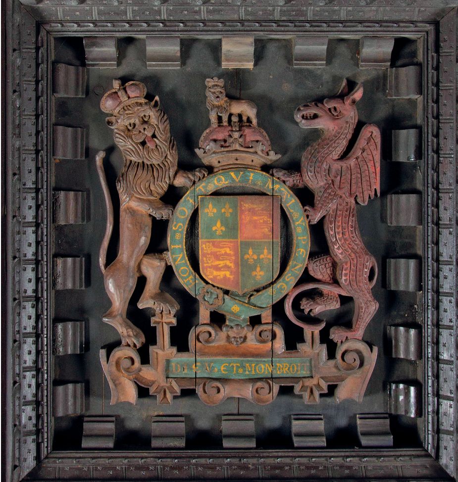
Figure 4: The supposed ‘Boyhood arms of Henry VII’ inserted on the underside of the tester on the ‘Radcliffe bed’, c.1843–48.

I will give you a faint sketch of the bed at the lower end in front are three coats which I will sketch over the page. 7