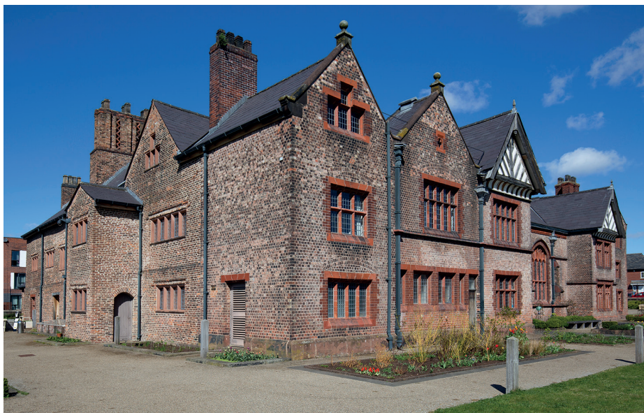
Figure 8: Ordsall Hall, Salford.