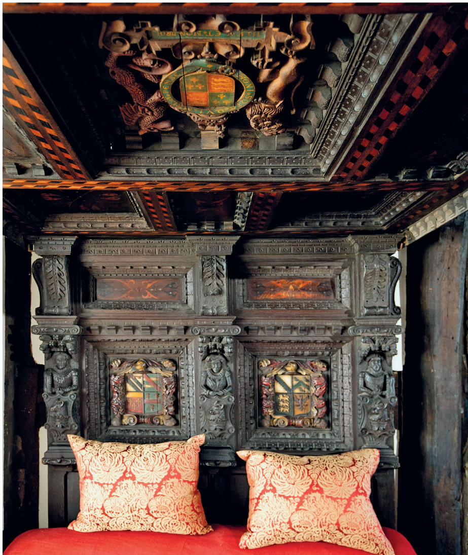
Figure 5: The headboard of the ‘Radcliffe bed’, c.1572, c.1843–48. Private Collection on loan to Ordsall Hall, Salford.